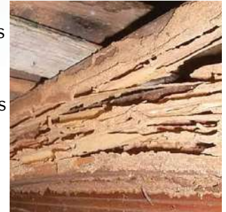
Subterranean floor joist damage

Subterranean termites cause the most damage of any termite species. These termites build distinctive tunnels to reach food sources and protect themselves from the elements. They eat wood 24 hours a day, seven days a week. Over time, subterranean termites can critically damage a building structure, sometimes causing a total collapse.