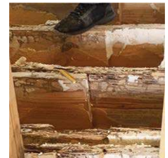
Joist damage under spray foam

Spray foam hides termite, mold and wood decay damage. It can also hinder a termite inspection. Wooden beams covered in spray foam are inaccessible to inspection, which can invalidate a termite warranty. Treating with Bora-Care prior to spray foam application solves this problem.