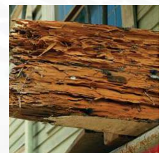
Formosan termite damage

Formosan termites are a subterranean species of termite. Often referred to as "super termites," they are the most voracious and aggressive of more than 2,000 termite species, chewing through wood, flooring and even wallpaper undetected.