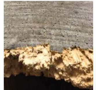
2x6 barn flooring destroyed by beetles

Unfortunately, your wood can be infested with these pests and you may never know. That's because hidden larvae cause most of the damage. It can typically take up to five years, sometimes much longer, for larvae to mature into adult beetles and eat their way to the surface, creating visible exit holes.