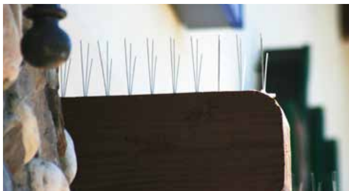
The spikes can be glued, screwed or tied down.