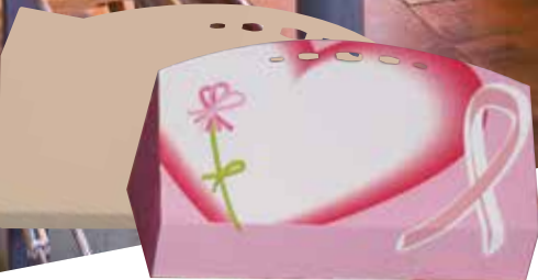
Magnolia Product code: MANUP3035/125-000201