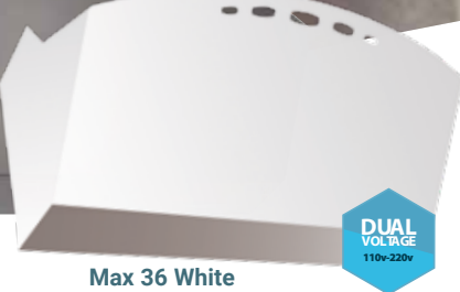
Max 36 White Product code: 125-000404