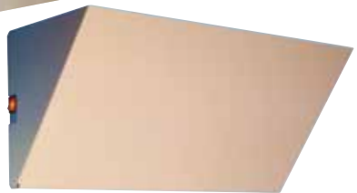
220v Uplight: Magnolia Product code: MANUPL024/125-000300 (220v - Euro plug)