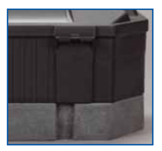
Durable —Architectural-grade concrete lasts in tough environments.