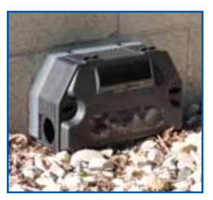
Professional —Great looking design enhances your image.