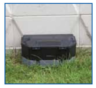
Savings —Less time assembling means more time servicing.