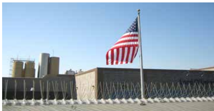
Bird Spike 2001™ installed on a parapet wall.