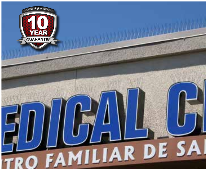
Bird Spike 2001™ installed over channel letters and parapet wall.