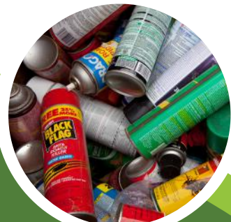
REDUCE CAN WASTE