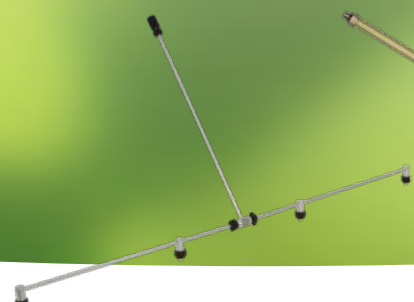
Spray boom Art.no. 11889501-SB/I507671

Great for controlled spraying of herbicide around plants, shrubs, and trees. Spray hood is a must on windy days to keep product from drifting to areas that do not need the application.