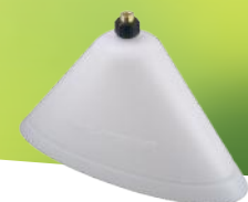
Spray hood Art.no. 10501606/I507670

Great for controlled spraying of herbicide around plants, shrubs, and trees. Spray hood is a must on windy days to keep product from drifting to areas that do not need the application.