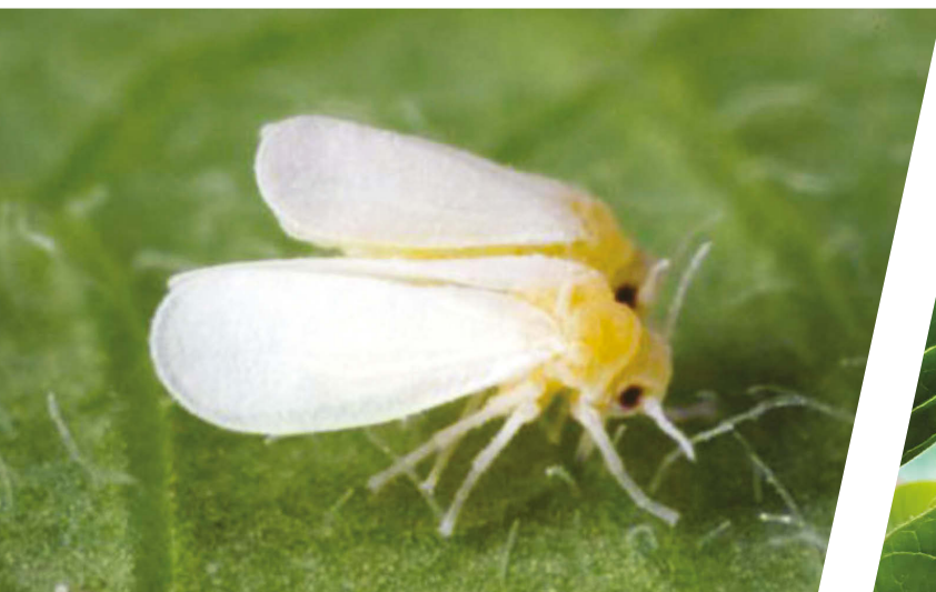
Adult whiteflies ( Bemisia tabaci ).