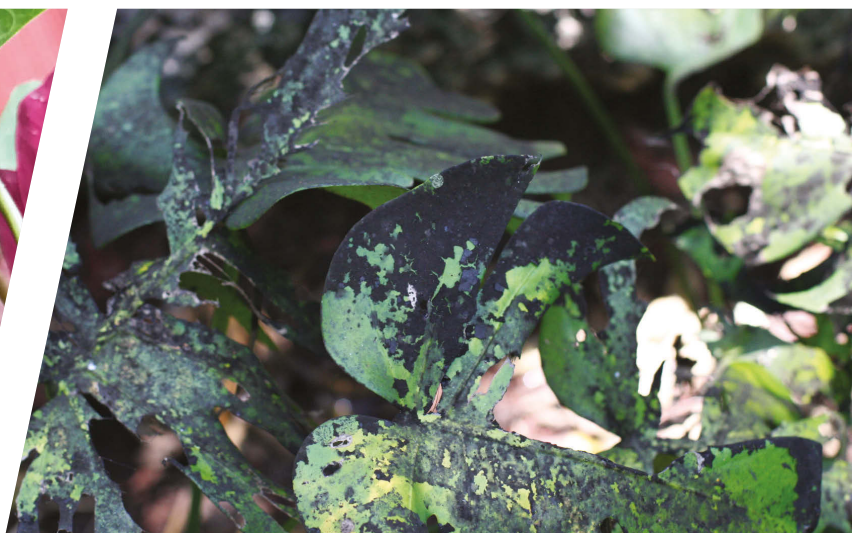
Sooty mold ( Capnodium sp.) on Philodendron leaves.