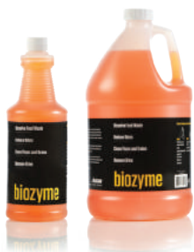
| #100610 QT / #100615 GAL

WATCH OUR TRAINING VIDEO ON HOW TO APPLY BIOZYME AT WWW.ANSTARPRODUCTS.COM