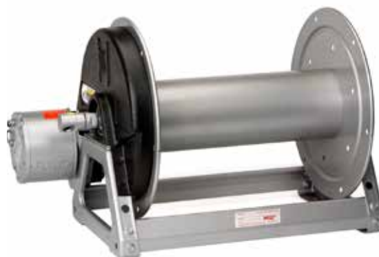
Electric Rewind Standard configuration shown