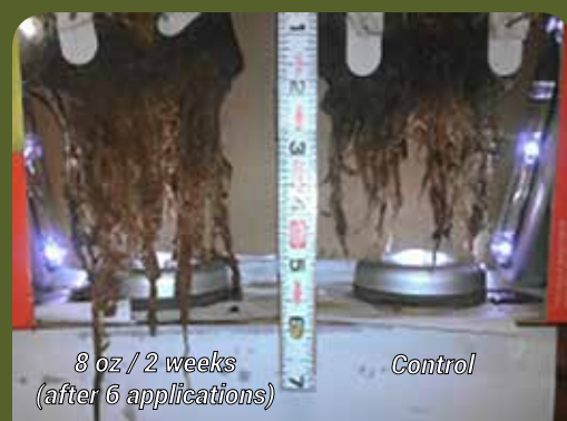
Bent / Poa Putting Green