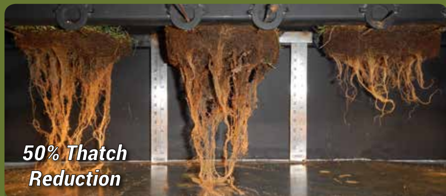
Poa fairway 16 ounces per 1,000 ft 2 every 30 days (after 3 applications)

Consistent and Proven. Worm Power Turf has been awarded 17 peer reviewed research grants from State and Federal Agricultural Agencies and 10 years and 3 million dollars in research has demonstrated Worm Power Turf produces stronger, healthier and more vigorous plants.