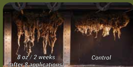
Poa Putting Green