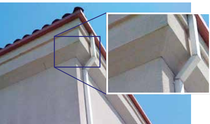
Bird Slope™ installed under eaves.