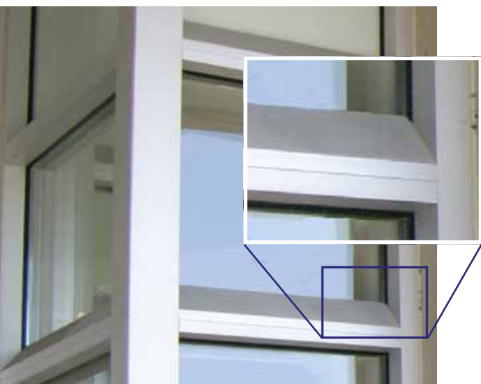
Bird Slope™ installed on window sills.