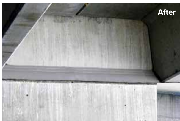
Installed in parking garages.