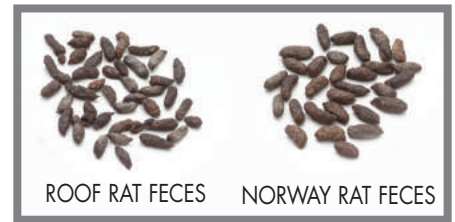
ROOF RAT FECES