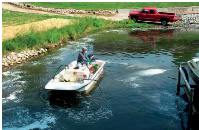
For use in residential swimming areas such as docks and beaches to reduce sediment "muck" buildup.

Colony-forming unit (CFU) is a measure of viable bacterial or fungal numbers. CFU measures viable cells in solution. Therefore, it is the microbiological load or the concentration (CFU/milliliter or gram) of the colonies in the product.