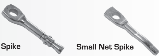
Large Net Spike