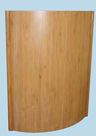
Made with REAL bamboo