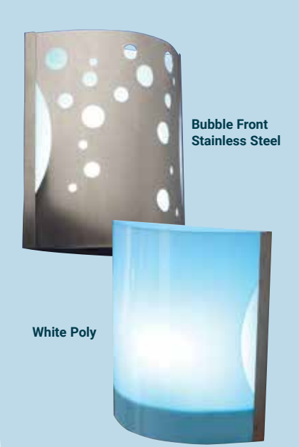
FREE STANDING TABLE TOP DESIGNS