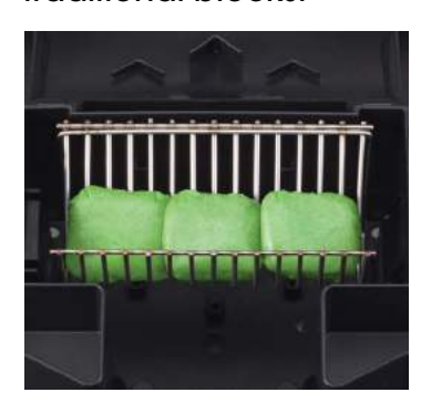
The SST is not recommended for use in M.P.U., Protecta and Protecta Sidewinder.