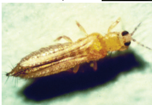
Western flower thrips